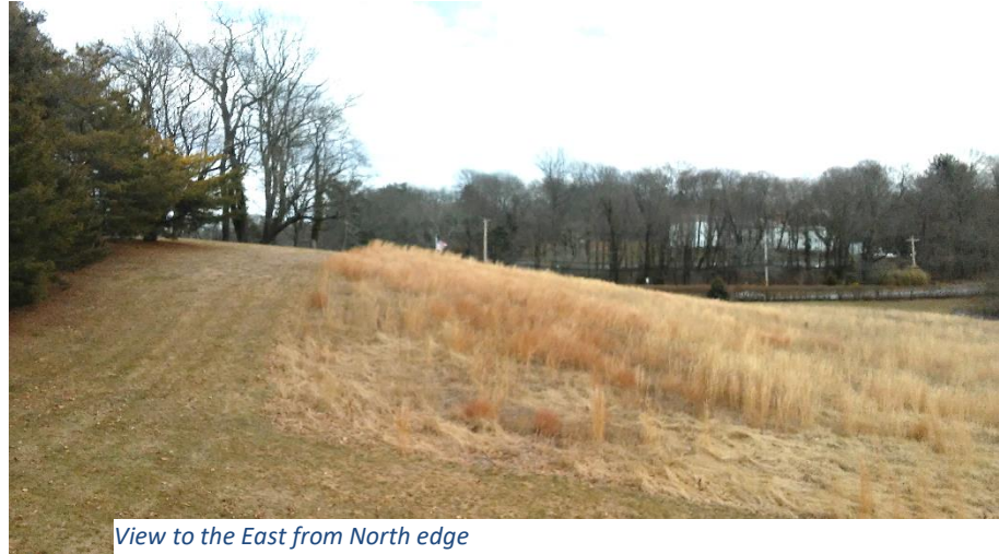
View to the East from North edge

This unit is closely surrounded by multiple commercial, residential and office structures and community infrastructure as well as heavily used roadways. Greentree officials state that the residential community just west of the burn unit frequently reports concerns to Greentree