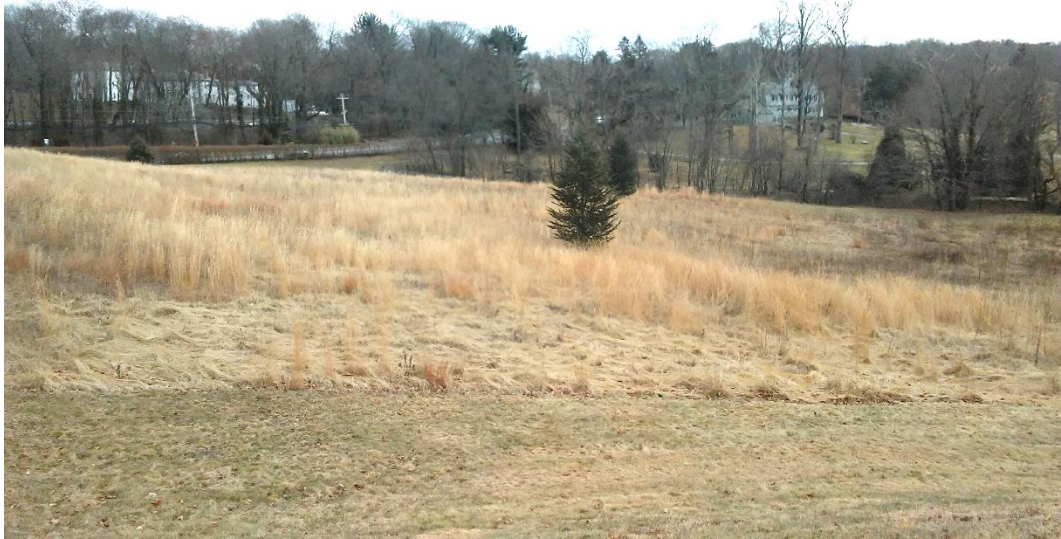
View SE from the N edge

This new Unit for the Greentree Burn Plan is 3.25 acres, but the burnable fuel acreage is actually 2.5 acres. The reason for this is that there are wide mowed buffers surrounding the interior area where native grasses and forbs have been planted for restoration. The unit basically runs uphill from a timbered wet drainage to the south and climbs on an 11% slope to the Greentree boundary line to the north. The fuels consist of Fuel Model Gr6, Moderate Load, Humid Climate Grass