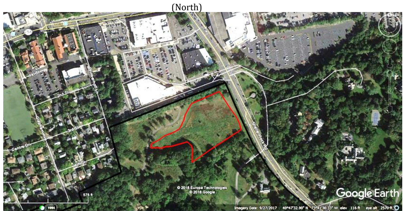
G2 Unit slopes from South to North

Ideal wind vector NW to NE but properly applied strip ignition techniques combined with real time smoke monitoring can widen the window.